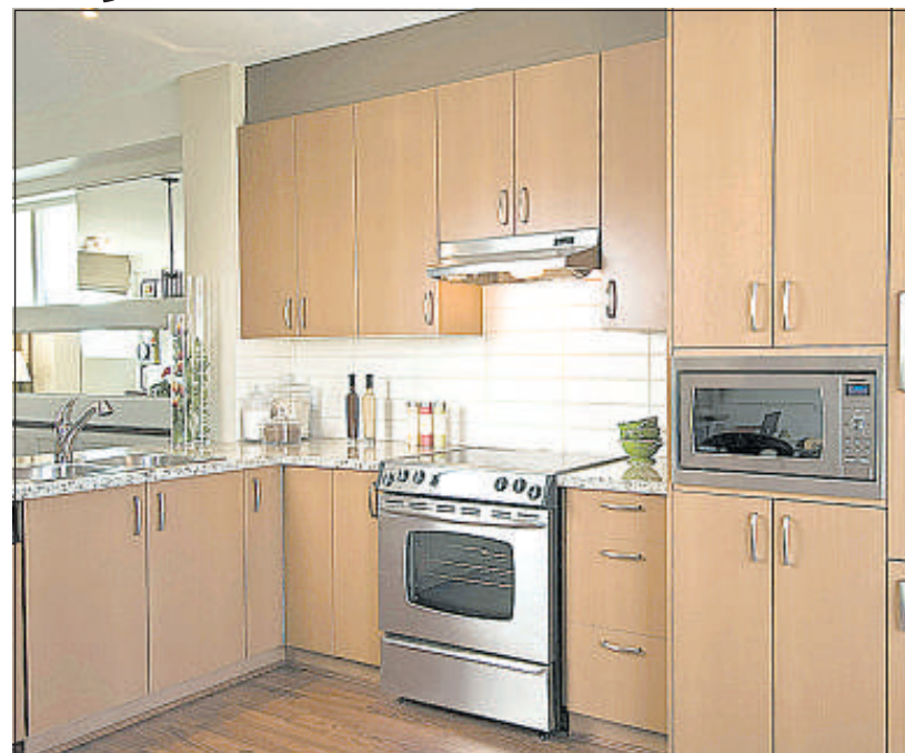
Oversized pot drawers provide plenty of storage space, while the granite countertops are attractive and easy to clean.

Oversized pot drawers pull out smoothly and provide plenty of storage space. Granite countertops look attractive and are easy to clean, and you can select an