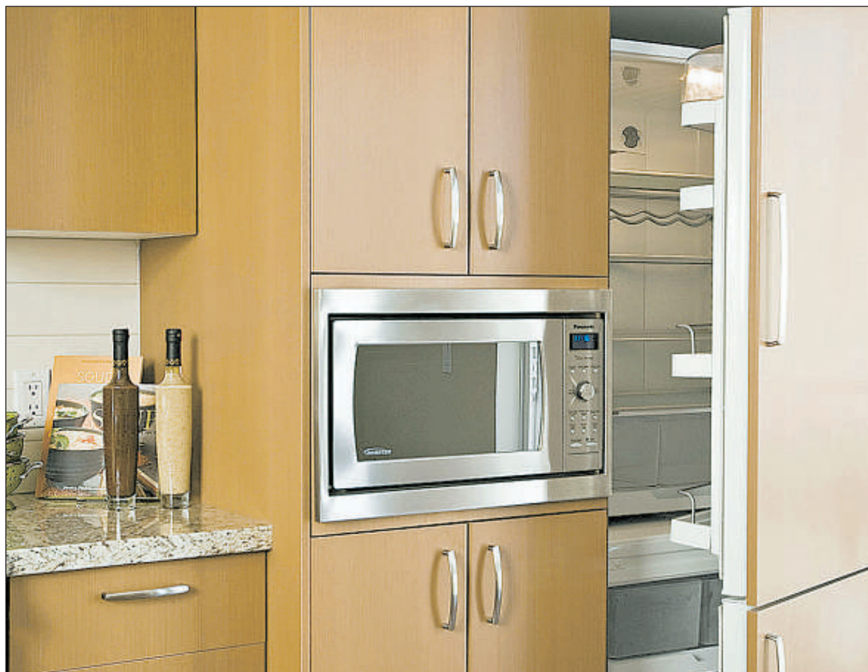
Continued on next page The Kaleden kitchens show fine, clean lines with built-in microwaves.

Resale aside, Kaleden represents townhouse residency that offers convenience, green building credentials, green space and the Evergreen Club, an on-site 7,500-square-foot private community centre with a swimming pool and hot tub.