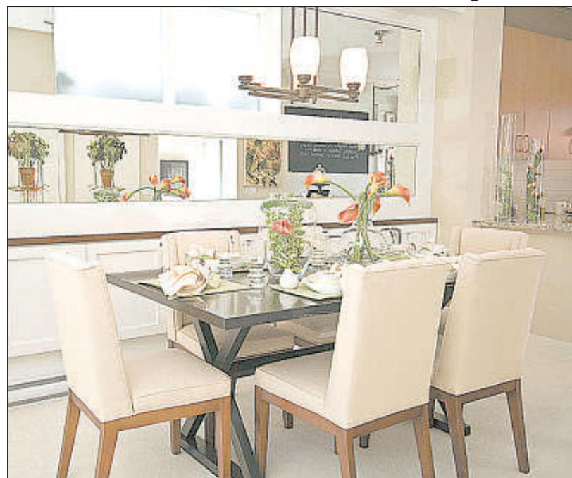
The stylish dining room in the third phase of The Polygon development company's Kaleden new-home project.

Polygon has four immaculately detailed showhomes on the Kaleden property right now that pro-