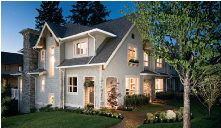
Buyer's respond to amenities and value making Polygon's Kaleden and Cathedral Grove successes in the new South Surrey neighbourhood of Morgan Heights.

There's a reason the quiet, treed corridor along South Surrey's 158th Street has become such a popular place. Walking distance to top-ranked schools and a brand new and expansive selection of urban village style boutique shopping and dining, a short drive to the sandy beaches and shoreline trails of White Rock or the lush greens of Morgan Creek Golf Course, Polygon's Kaleden and Cathedral Grove new home communities sit among the best this area has to offer.