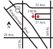
Polygon Cathedral Grove Townhomes Ltd. Polygon Kaleden Townhomes Ltd.

The Kaleden and Cathedral Grove sales offices and display homes, as well as the impressive Evergreen Club, are open from noon to 6pm except Friday, and are located at 27th Avenue and 158th Street in South Surrey. For information please call 604.541.4246 (Kaleden) or 604.541.7383 (Cathedral Grove), or visit polyhomes.com .